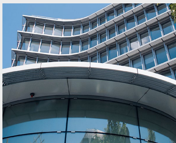
Head Office of Vontobel

Vontobel's mission is to protect and build the wealth our clients have entrusted to us over the long term. Specialising in active asset management and tailor-made investment solutions, we provide responsible and forward-looking advice. In doing so, we are committed to Swiss quality and performance standards. With their good name, our owner family has stood by these principles for generations. Around 1,400 employees worldwide provide first-rate, customized services for clients with an international focus. The registered shares of Vontobel Holding AG are listed on the SIX Swiss Exchange. The Vontobel families and the Vontobel Foundation hold the majority of shares and votes in the company.